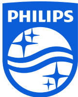
ELE BALLAST (3) F32T8 120-277V