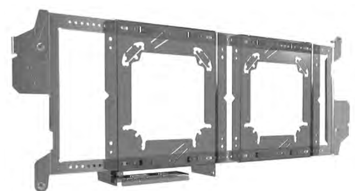
Telescoping bracket with box mounting brackets installed