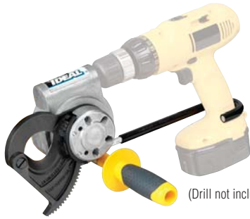
(Drill not included)