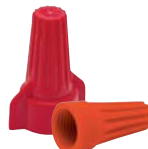
WingTwist™ / WireTwist™