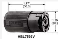
2P3W, 15A 125V, ML-2R, Black Nylon Body