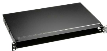
Opticom Rack Mount Fiber Trays