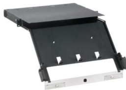
Opticom Rack Mount Fiber Enclosures