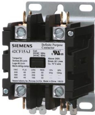
Contactor, 42DP,40A,2P,Open,120 Contactor, 42DP,40A,2P,Open,120