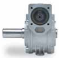
(Style B Shown)