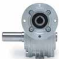
(Style BMQ Shown)