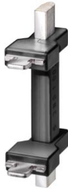
LV HRC disconnecting blade Sz. 1 Insulated grip lug