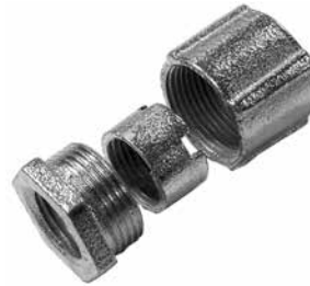
TPC - 50