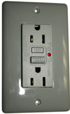
15A 125V AC, LED Series

15A 125V, 2P 3W, Flush Thermoplastic Face, Back &amp; Side Wired, Matching Wall Plate Included, Ivory