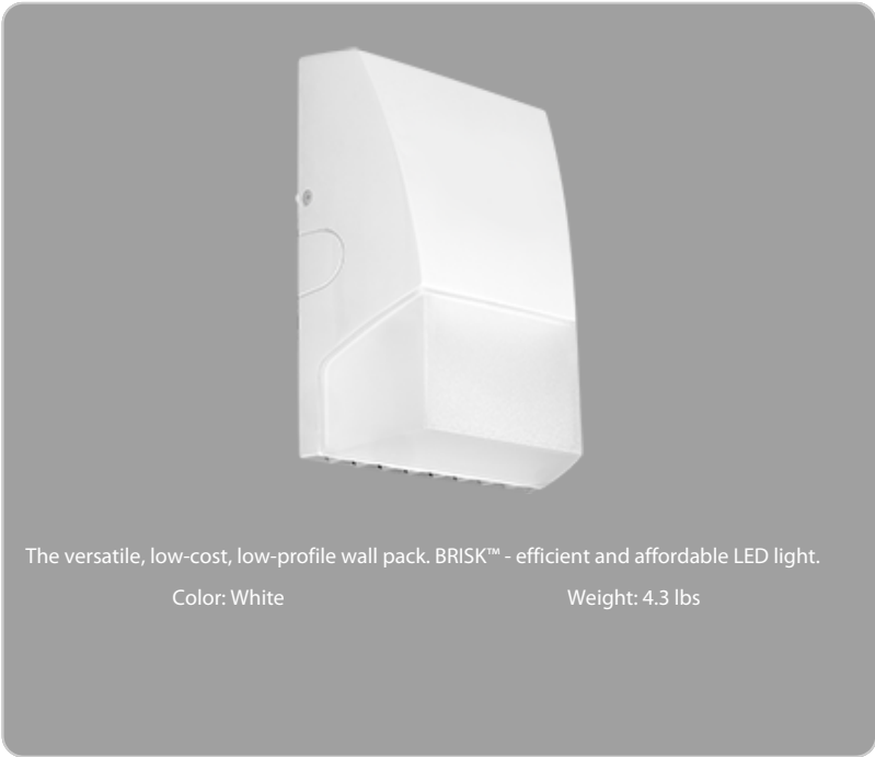
The versatile, low-cost, low-profile wall pack. BRISK™ - efficient and affordable LED light. Color: White Weight: 4.3 lbs