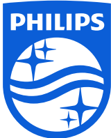
MH BAL 100W 90/140 QUAD KIT