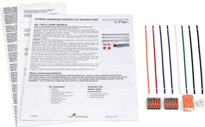
Lutron ballast retrofit kit instructions, wires, and connectors