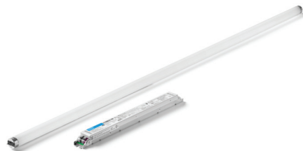
T8 linear, 1-lamp Lutron ballast retrofit kit by C-Flex with a Lutron EcoSystem M-can Lutron driver control