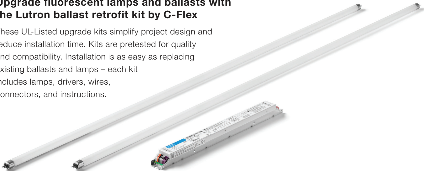
T5 Linear, 2-lamp Lutron ballast retrofit kit by C-Flex with 3-wire Lutron driver control

These UL-Listed upgrade kits simplify project design and reduce installation time. Kits are pretested for quality and compatibility. Installation is as easy as replacing existing ballasts and lamps – each kit includes lamps, drivers, wires, connectors, and instructions.