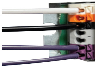
EcoSystem Digital Control