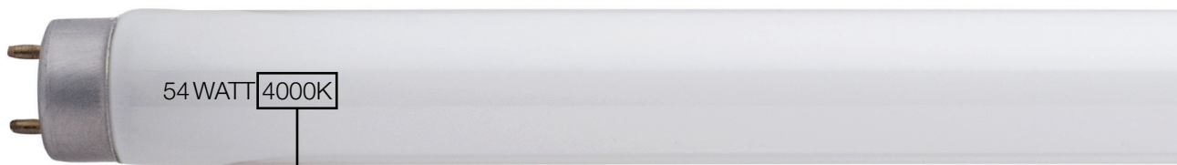
3000K, 3500K, 4000K, 5000K