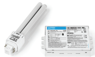
Vertical, 1-lamp Lutron ballast retrofit kit by C-Flex with a 3-Wire K-can Lutron driver control