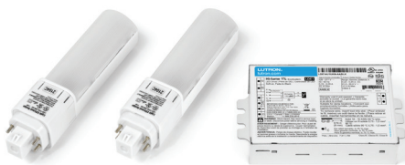
Horizontal, 2-lamp Lutron ballast retrofit kit by C-Flex with a Lutron EcoSystem K-can Lutron driver control