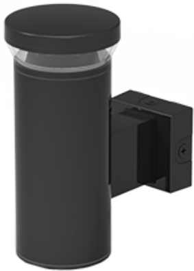
18 Watt LED wall sconce. Die-cast aluminum wall bracket with five 1/2" conduit openings with plugs.