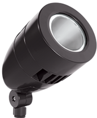
Bullet shape die cast aluminum flood with spotlighting for over 40 feet away. Color: Bronze Weight: 4.6 lbs